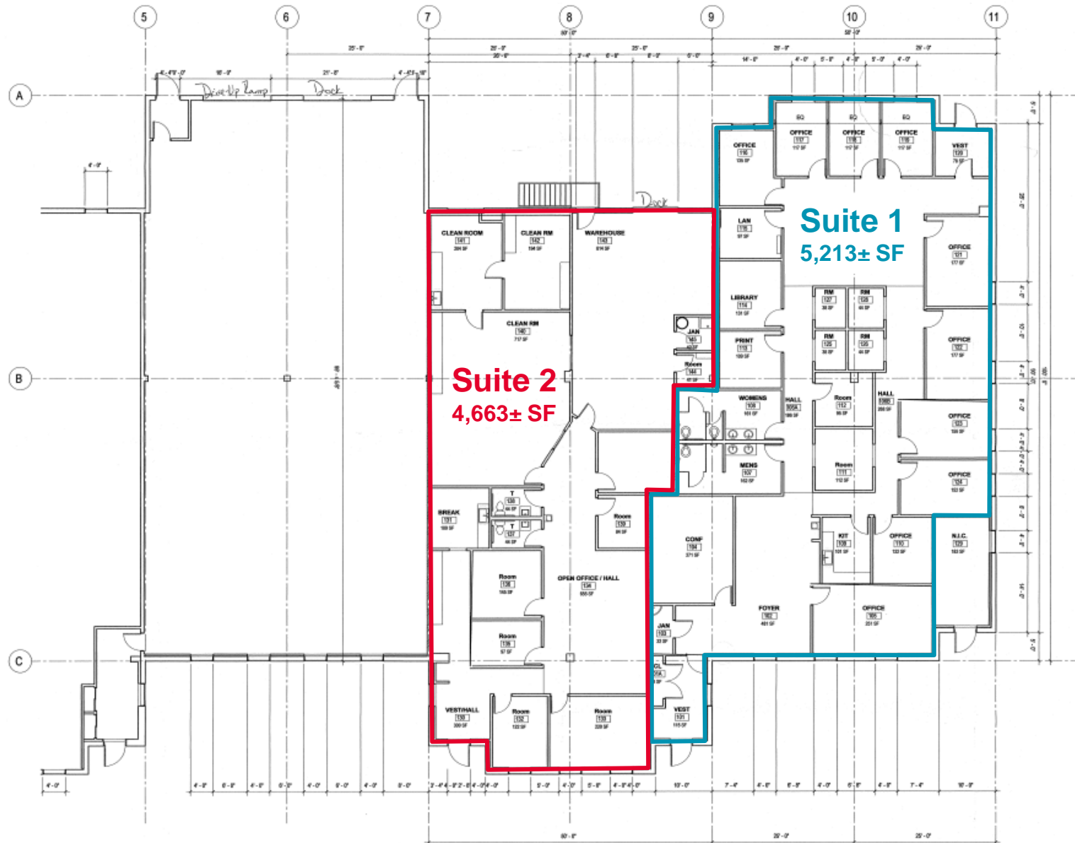
10 ENLARGED PARTIAL FLOOR PLAN