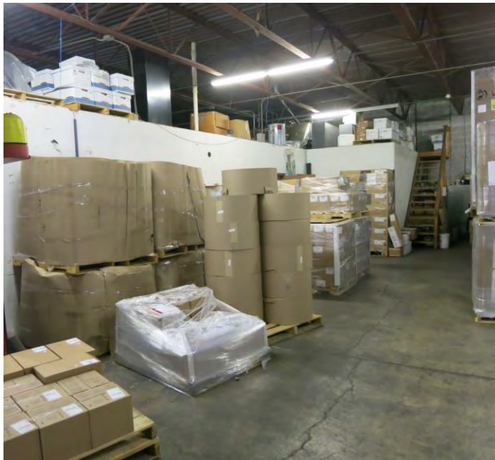
Warehouse/Entrance to Mezzanine