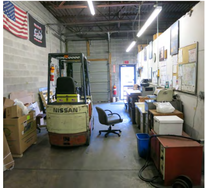
8'x8' Dock Door