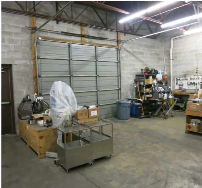
12'x10' Drive-In Door