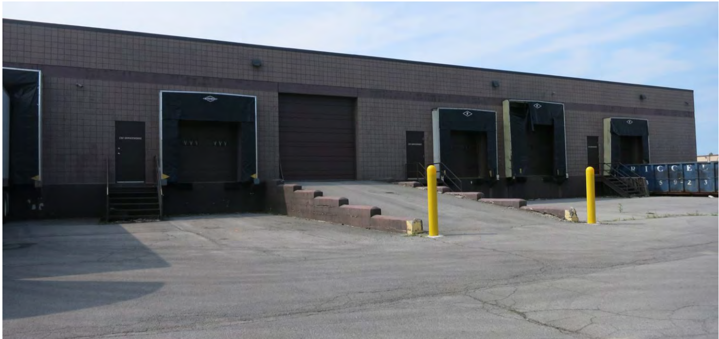
Rear entrance with (3) docks (8'x8') and (2) drive-in doors (12'x12')