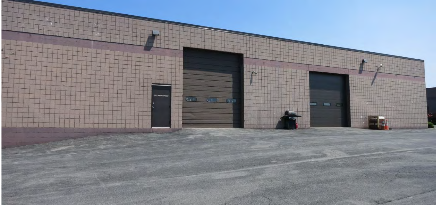
Side entrance with (2) drive-in doors (12'x14' and 12'x12')